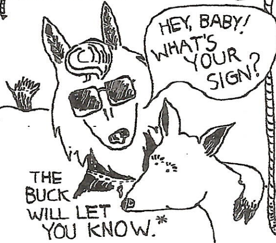
HEY, BABY! WHAT'S YOUR SIGN?