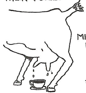
MILK PRODUCTION MAY DROP... DROP... DROP..

IF YOU'VE LEFT THE DOE WITH A BUCK FOR A YEAR OR SO, SHE'LL BE SURE TO COME INTO HEAT THE DAY AFTER YOU BRING HER HOME.