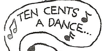
TEN CENTS A DANCE...