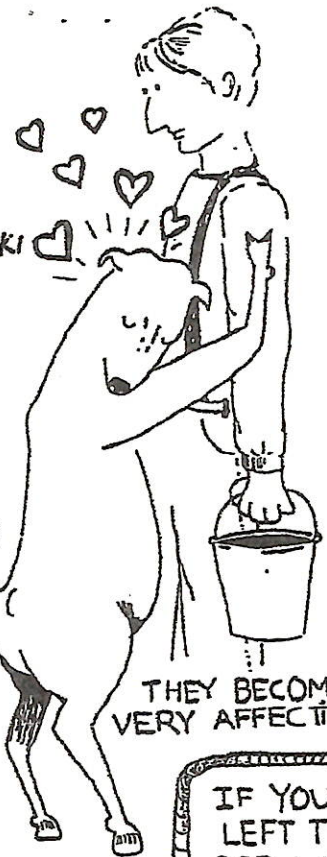
THEY BECOME VERY AFFECTIONATE.